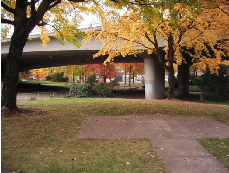
Horseshoe Pits from the west