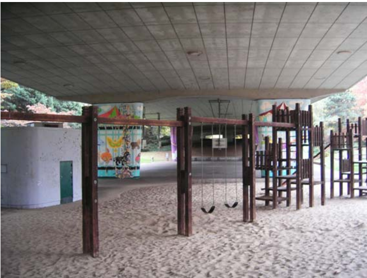
The playground looking south