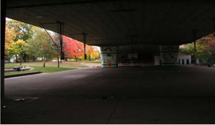
Looking north at the stage