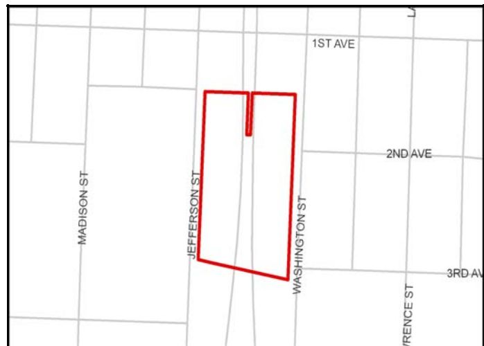
Proposed location of skatepark